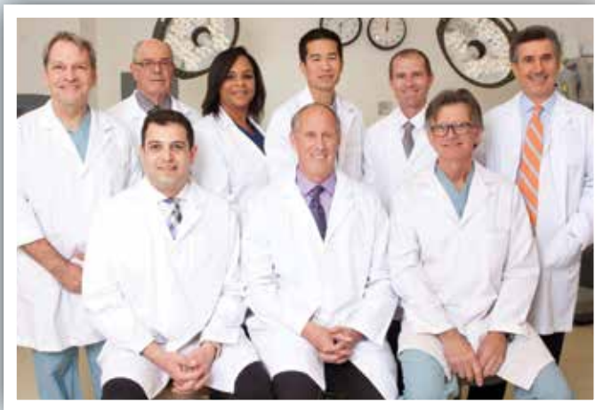
The orthopedic team follows proven protocols before, during and after joint replacement surgery to support the best possible patient experience and outcomes.

Inland Valley Medical Center has earned The Joint Commission's Gold Seal of Approval® for Advanced Certification for Total Hip and Total Knee Replacement after undergoing a rigorous onsite review. Joint Commission experts evaluated compliance with advanced disease-specific care standards and total hip and total knee replacement requirements. This certification demonstrates Inland Valley's commitment to quality, consistency and patient safety.