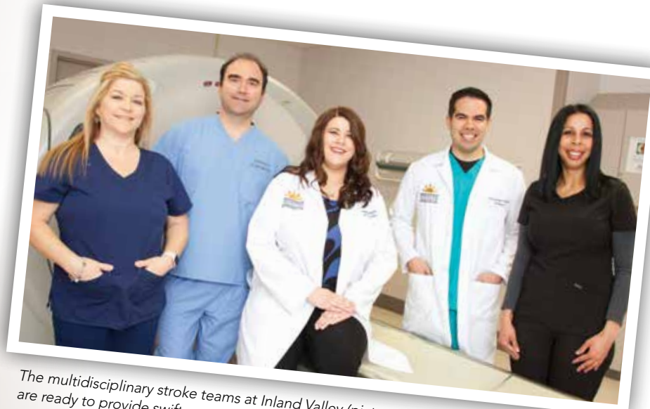
The multidisciplinary stroke teams at Inland Valley (pictured above) and Rancho Springs are ready to provide swift, potentially life-saving care 24/7.

According to the American Stroke Association, stroke is the fifth leading cause of death in the United States, killing nearly 130,000 people a year. Knowing the symptoms, and getting immediate help, are critical to saving lives and having the best possible recoveries.